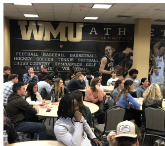
Western Michigan Univ.