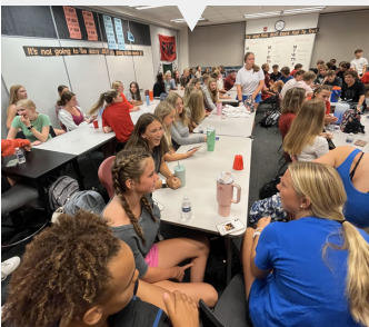
Forest Hills Eastern HS

These are student-led groups that meet before or after school. They consist of icebreakers or other activities along with devotionals or guest speakers to unpack what the Bible teaches about Jesus Christ. We've seen substantial growth into new school environments at the Middle School, High School, and Collegiate levels!